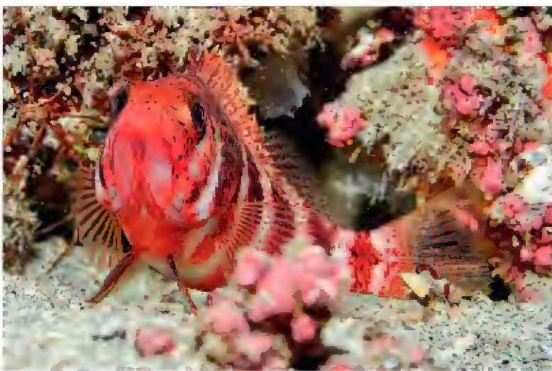
FIGURE 14. Throat of Serranus heterurus from the Cape Verde Islands.